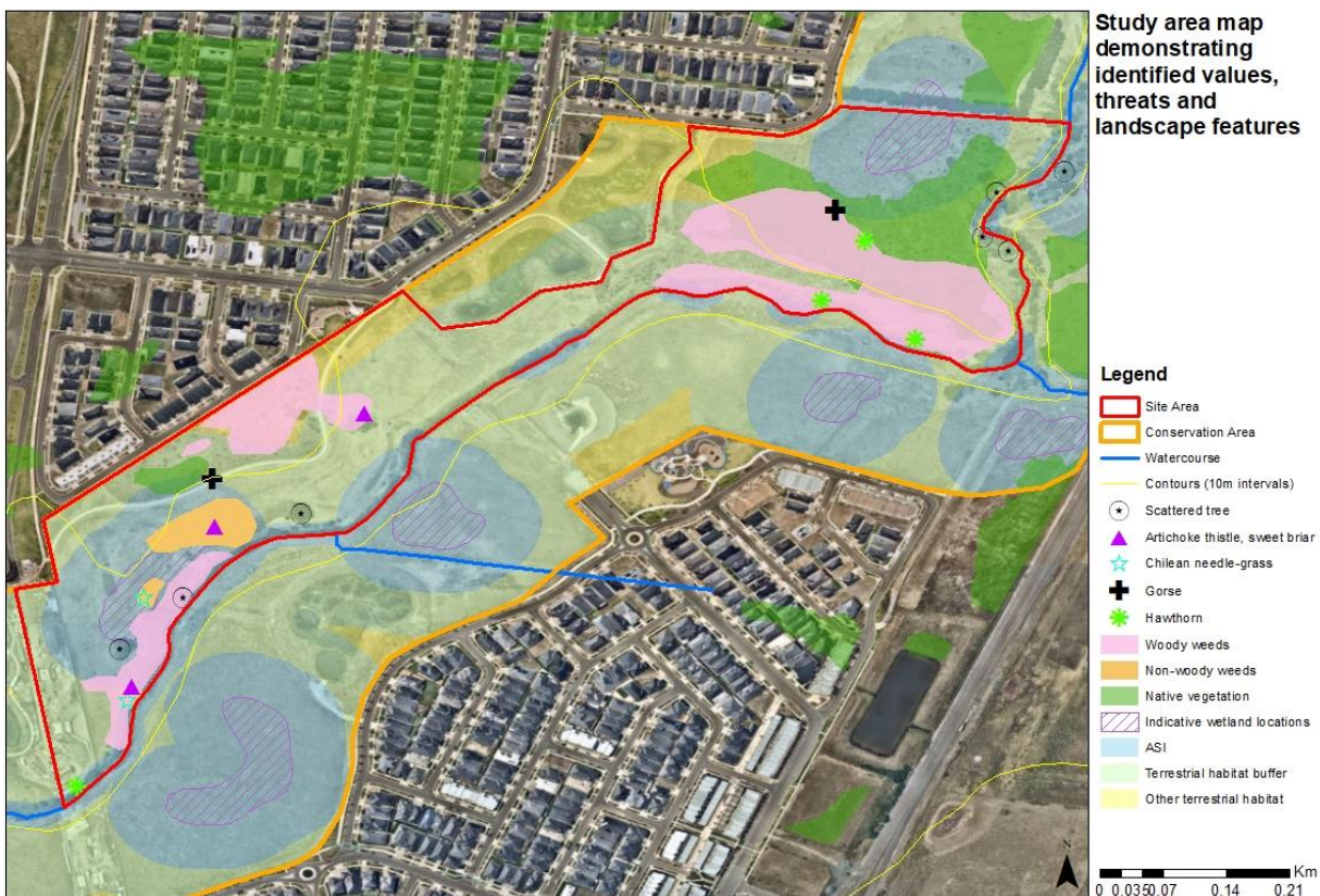
Figure 3. Example study area map demonstrating identified values, threats and landscape features

Rubbish (dumped or wind-blown from the adjoining development) and remnants of past land use (e.g. fencing, metal sheeting, concrete) are identified for removal. Farm fencing is to be removed by a suitable contractor, due to its potential to be a barrier and hazard for wildlife movement, land managers and the public. Rubbish is to be removed on foot, with regular inspections to be carried out and rubbish and hazards removed promptly.